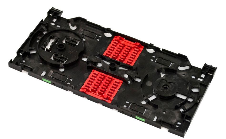
SCM-A-24H Cassette with an option for 24 fusion splices